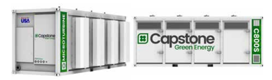
C800S Power Package

The Signature Series Microturbine provides 800kW of reliable electrical power in one small, ultra-low emission, and highly efficient package.